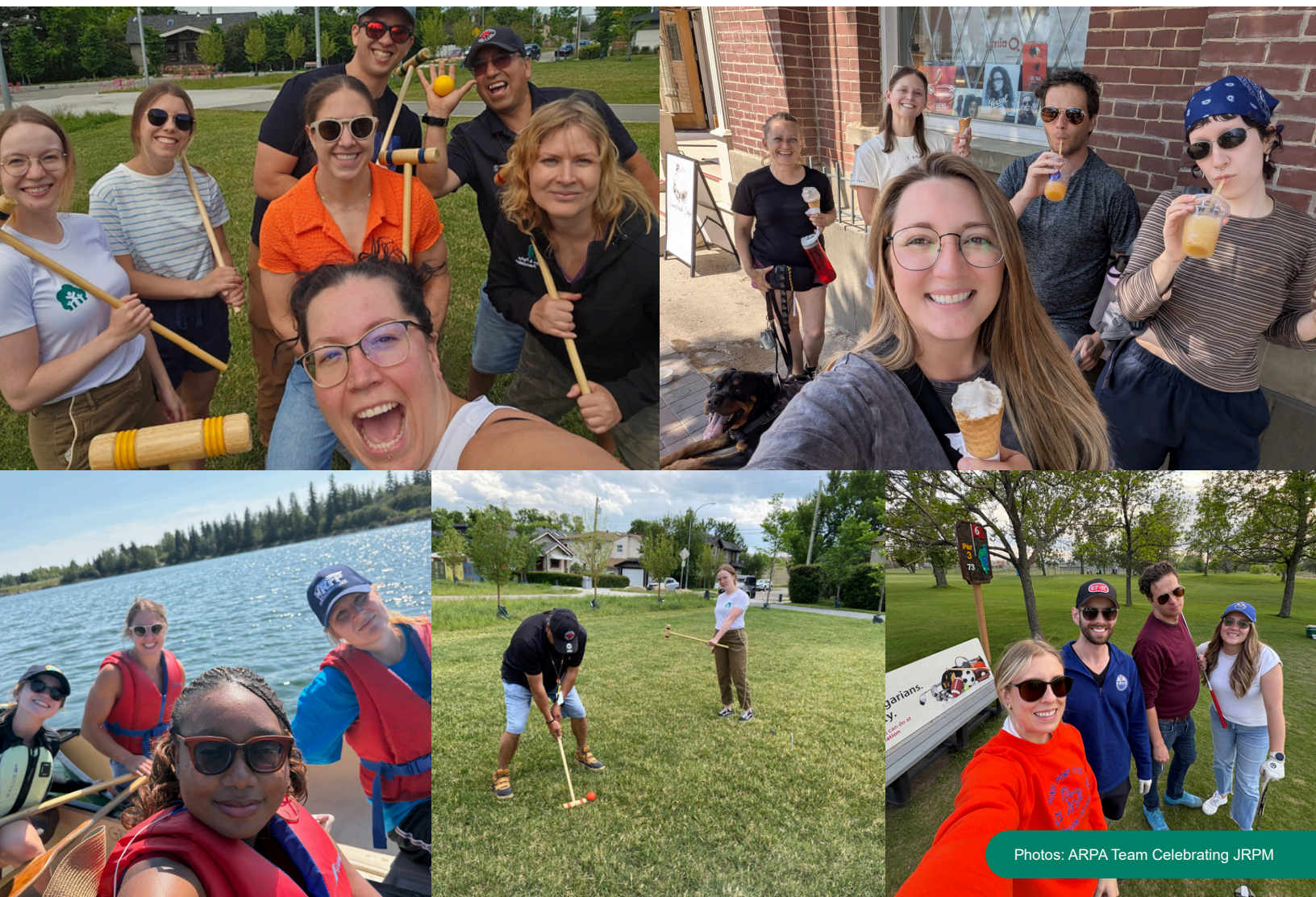
Celebrating JRPM