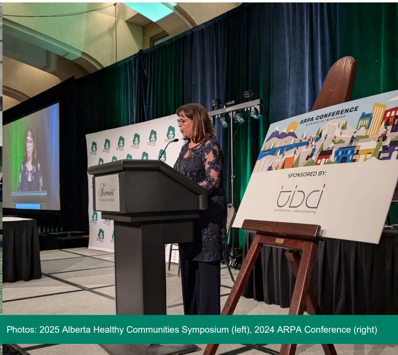
Photos: 2025 Alberta Healthy Communities Symposium (left), 2024 ARPA Conference (right)