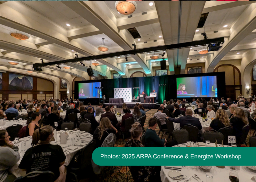
Photos: 2025 ARPA Conference & Energize Workshop