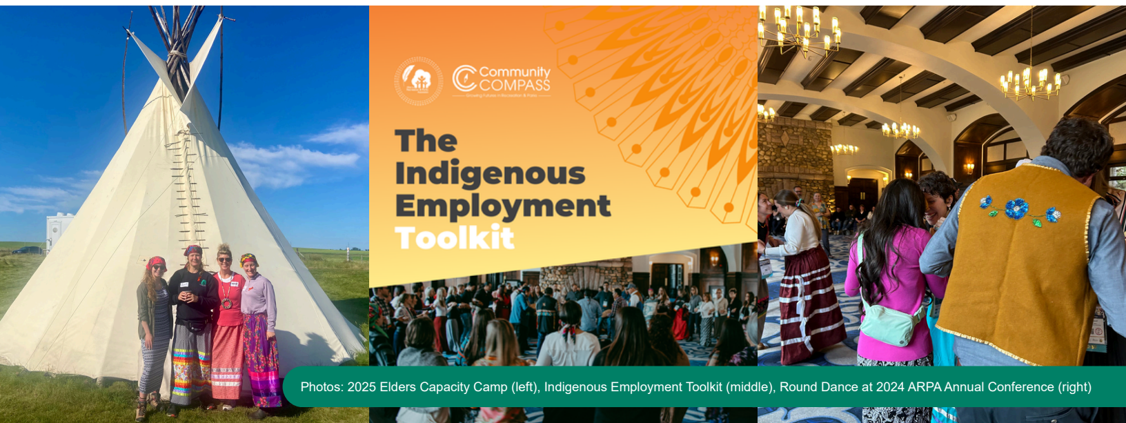
Photos: 2025 Elders Capacity Camp (left), Indigenous Employment Toolkit (middle), Round Dance at 2024 ARPA Annual Conference (right)