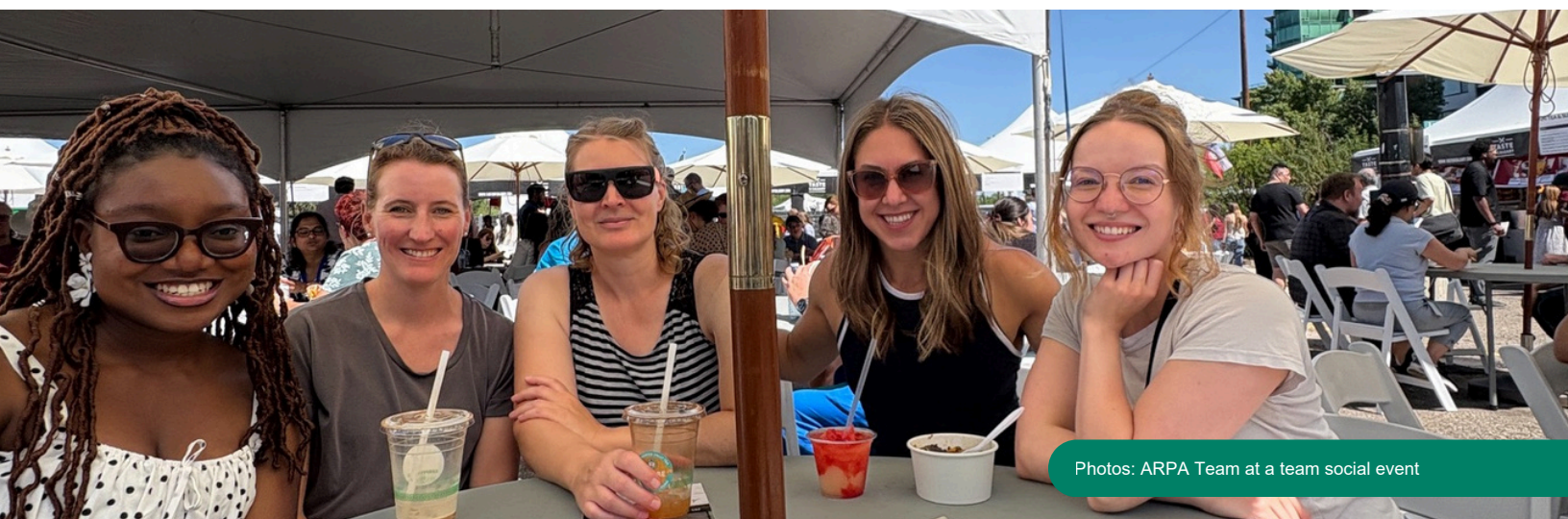
Photos: ARPA Team at a team social event

We extend heartfelt thanks to the many leaders, volunteers, and supporters who made the RFLF's achievements possible over the past 25 years. ARPA's Board of Directors is committed to carrying forward this spirit of generosity through our own fundraising initiatives and continued stewardship of the current legacies, with exciting opportunities on the horizon including our 75th Anniversary celebrations in 2026.